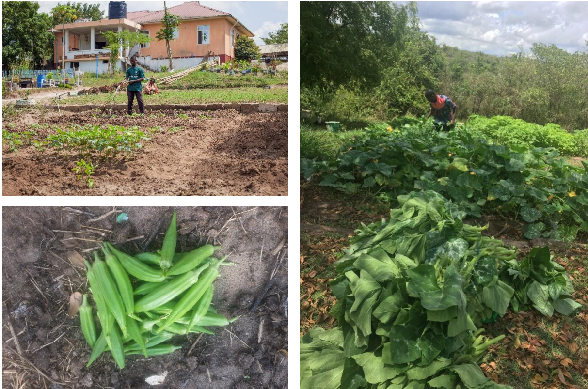
Figure 1: Impressions of the farming plots of Mulimuli in 2020

Building on the experiences in 2019 the small-scale vegetable/crop farming on the plot (on ca. 150m 2 ) continued across 2020. As in 2019 the biggest challenge was still the scarcity of water. Despite improvements of the water supply by the end of 2019, the supply became more and more irregular again starting in August 2020. To cope with the never-ending issue of water scarcity, the team is currently talking to a nearby chicken farmer who has built a well. This could be a possible reliable water source for the future.