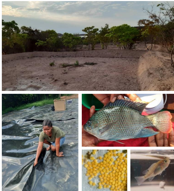
Figure 4: Impressions of BongoFISH 2020. Picture on the top shows the establishment of the first ponds in Kipili (Oct. 2020).

Due to the pandemic, it was decided to not participate in any training programs in 2020. An alternative idea was to look for suitable online courses. However, the main issue with online courses is the lack of reliable internet connection in Makongo Juu (resp. in TZ overall).