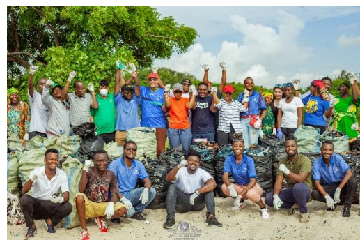
Figure 8: Beach clean-up team (March 2020)

After closure of the hostel in March, the Mulimuli team participated in a few beach clean-up events organized by "Save the Coast Tanzania", a locally founded group that clears beaches in Dar es Salaam from garbage.