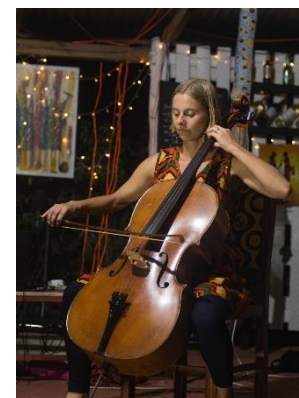
Figure 7: Impressions from the OneMic Jam Session in 2019