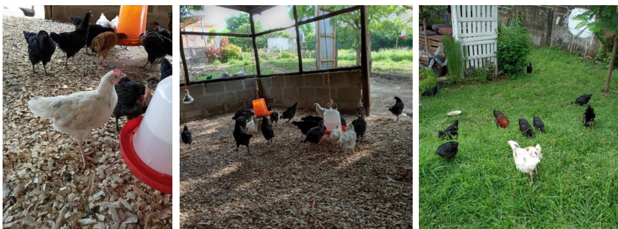
Figure 3: The Mulimuli chicken farm consisting of two 35m 2 stables and a protected 100m 2 outside area (December 2019)

At the temporary closure of the hostel the Mulimuli members agreed that who wants to, can take their chickens home to support them during the coming months. 4 members each took their 5-10 chickens home. One member sold all chickens immediately, the others focused on egg production but did not record numbers as initially agreed (this was expected).