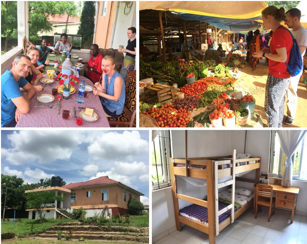
Figure 5: Impressions of Teddy's Home Hostel (2019-2020)

The mission of Teddy's Home Hostel is to make your stay in Dar es Salaam as comfortable and exciting as possible and to show travelers the real Dar. By combining the local culture with the tourist's cultures, the hostel creates an environment where everybody feels welcome and at home. The hostel offers 2 dorm rooms with 4 single beds (2 bunk beds each) with a shared bathroom as well as 2 rooms with a double bed and a private bathroom each.